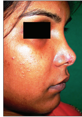
Figure 3g: Result at 10 months showing considerable improvement in hyperpigmentation by application of a hydroquinone cream locally