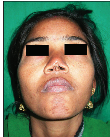
Figure 1a: A 35-year-old lady with a 12 mm × 6 mm traumatic loss of superficial columella