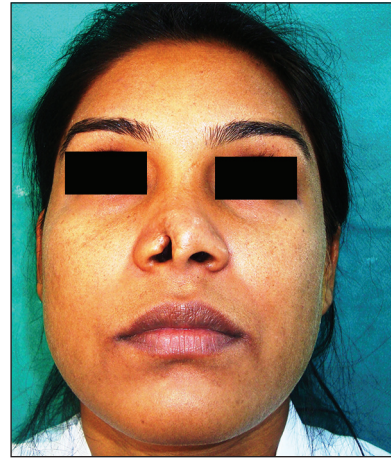
Figure 3a: A 24-year-old girl with a 10 mm wide defect in right alar margin resulting from trauma. A composite graft of same size was harvested from right ear's superio-lateral helical rim. Donor defect was closed primarily