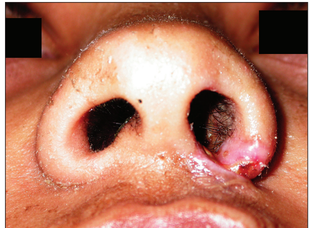
Figure 2b: A close up basal view of the nostrils at 15 th postoperative day. There is complete take of the graft but it is hypopigmented with a small area of epidermolysis still persisting

The nasal cavity is packed with paraffin gauze. The recipient site is smeared with an antibacterial ointment and left open for inspection. Immediately following surgery, and up to