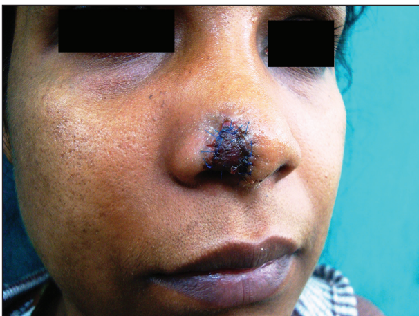
Figure 3d: Venous congestion of the graft on the 8 th postoperative day