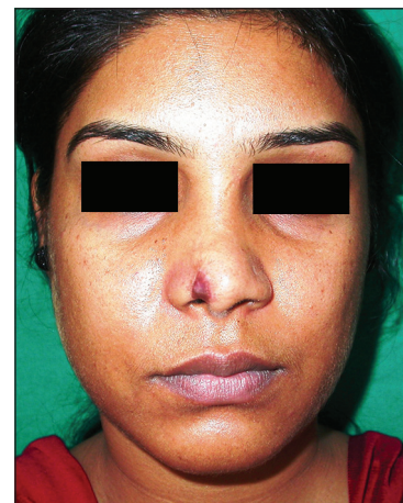
Figure 3e: Result at 3 months follow-up shows the graft has survived completely with some hyperpigmentation and graft shrinkage

using the 'glove finger' as the cooling tip on the graft. This is executed by the patient or his/her attendant with some help from nurses. No steroid creams or injections are ever prescribed. The follow-up has ranged from 3 to 10