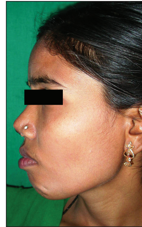
Figure 1e: Profile view of the patient at 6 months follow-up showing adequate restoration of columellar projection, albeit with hyperpigmentation