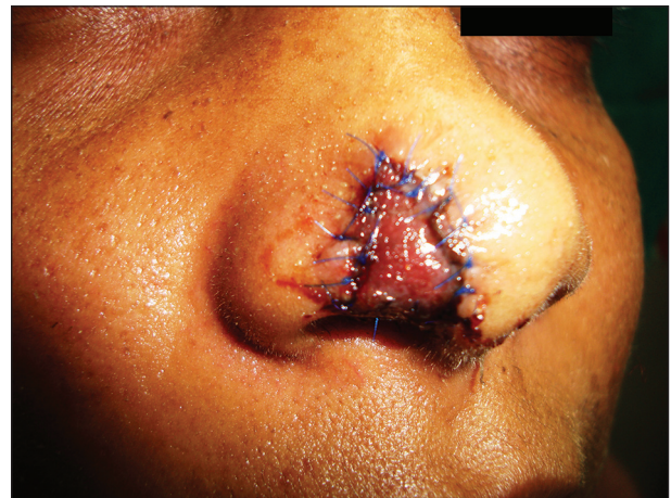
Figure 3c: Pinkish discoloration of the graft on 5 th postoperative day