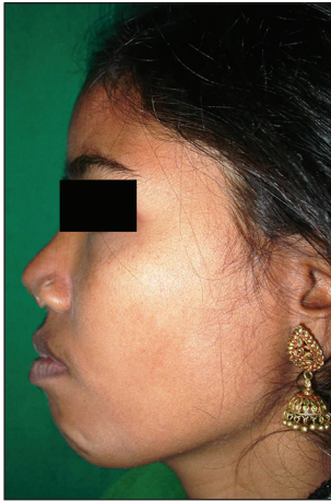
Figure 1b: Profile view showing loss of columellar projection