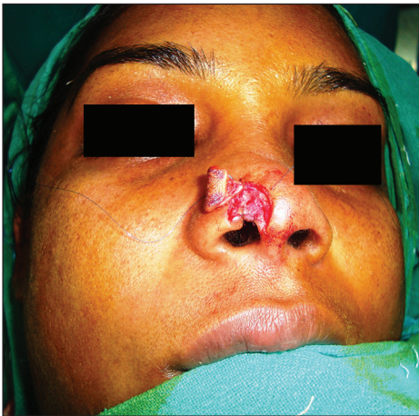
Figure 3b: A hinge flap was elevated from the recipient defect margin and the 'combination' graft was fixed into the defect