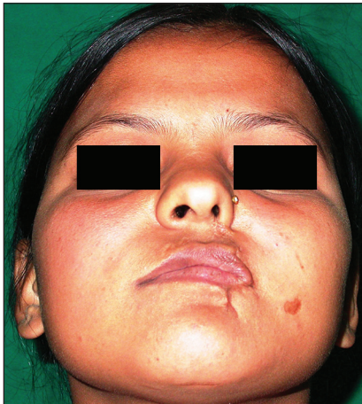
Figure 2a: A 19-year-old girl with constricted left nostril following acid burns. Right alar base and sill were reconstructed by a 10 mm wide wedge graft harvested from superior helical rim after recreating the defect. The donor defect was closed primarily