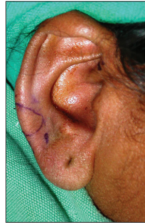
Figure 1c: An appropriate size composite graft was harvested from the lower helical margin and the donor defect closed primarily