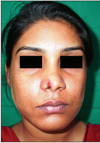
Figure 3f: Result at 5 months showing mild improvement in hyperpigmentation