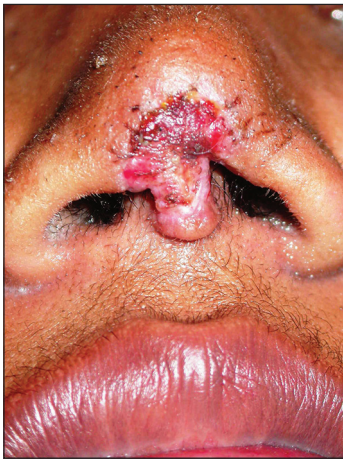
Figure 1d: A two-dimensional composite graft was placed on the defect. Result at 12 th postoperative day shows extensive epidermolysis